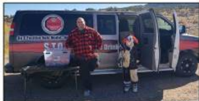
RACSTOP, Drug/Alcohol Prevention program for Rio Arriba county

Summary: On 31 October, Abiquiu Lake held its first "Trunk or Treat" event, giving members of the community a safe and fun place to bring kids for Halloween in an area with widely dispersed homes and communities. A total of 9 "trunks" participated and over 200 visitors came for the event. Both individuals and agencies participated in the event, including Rio Arriba 4-H, Jemez Electric Co-op, State Police, County Sheriff and Ghost Ranch.