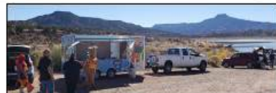
Bobber assists with reminding people about water safety even in the fall