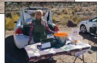
4-H program supporting the event