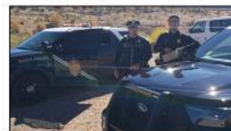
NM State Police and Rio Arriba Sheriff's Offices provided support and information